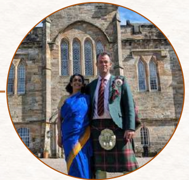
2025 Craufurd of Craufurdland