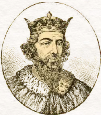
1066 Early Crawfords

The Craufurds of Craufurdland occupy a unique place in Scottish history- an unbroken thread woven into the fabric of the nation's past. With ancestral ties to figures such as Mary, Queen of Scots, James V, Charles I, Robert Burns, Sir Walter Scott, and Sir William Wallace, the stories of Craufurdland are truly unparalleled, captivating, authentic, and a testament to the enduring wonder of Scotland's heritage.